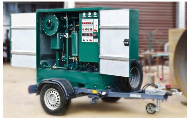
As option can be mounted on roadworthy trailer